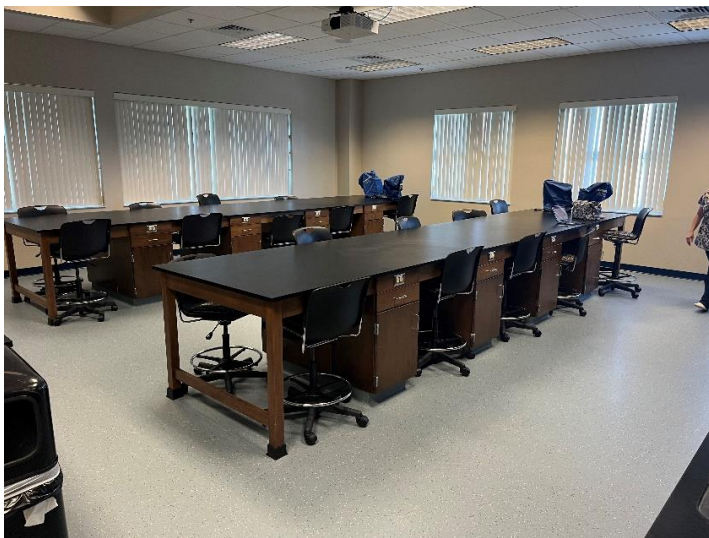
Clinical Pathology lab

Pinellas County has officially taken ownership of the Veterinary Technology Center: however, SPC now leases space there which includes our surgical suite, radiology room, animal handling areas and kennel space so our face-to-face classes are continuing without disruption. All lectures and faculty offices are held at the Seminole campus. The completion of our two new laboratory spaces at the Seminole campus are now completed and anatomy labs and clinical pathology lab courses are also held at the Seminole campus.